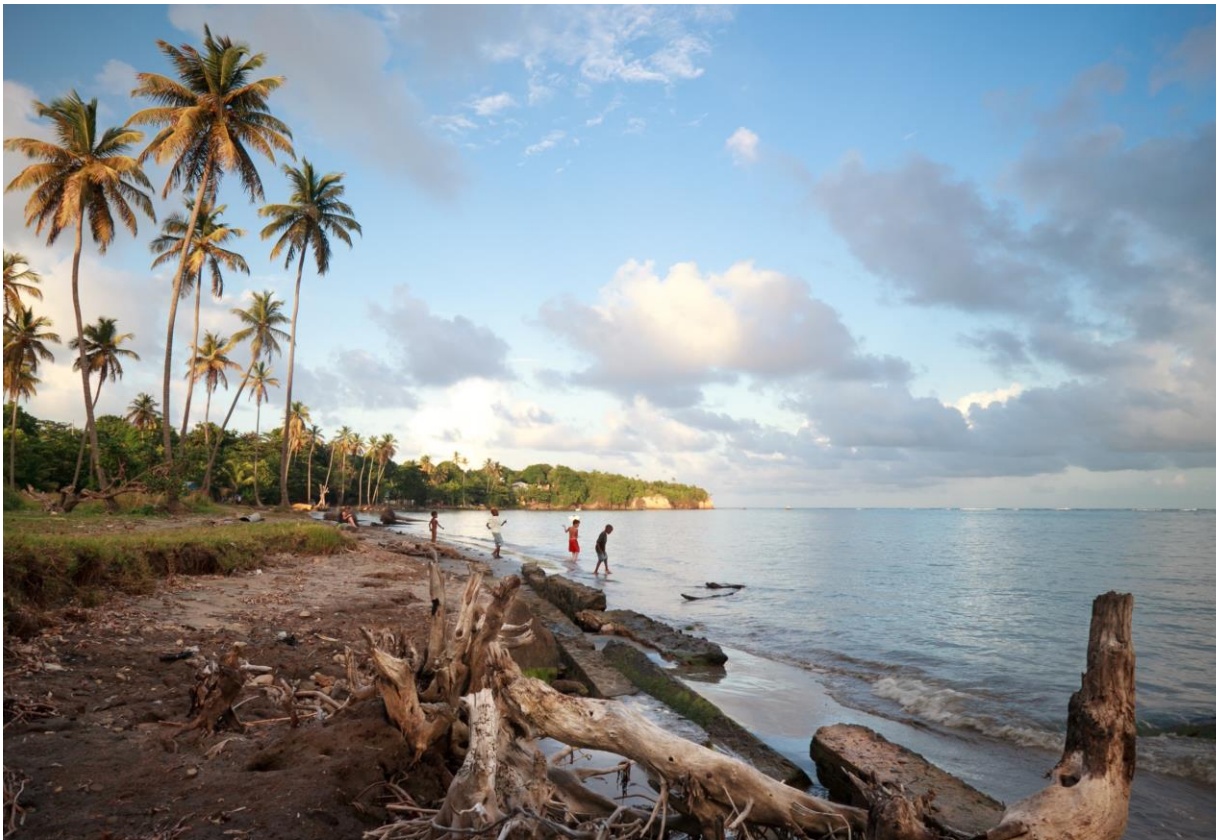
Telescope Bay

Grenville Bay Area - Grenada (Telescope, Grenville, Soubise and Marquis)