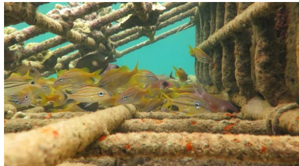
Pilot Structure 2016

Socio-Economic Benefits: Increased fish populations - more fish available to fishers, enhanced food security, increased economic activity within the community.