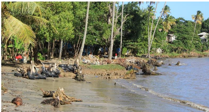
Coastal Erosion in Telescope

This has left residents grappling with the impacts of severe coastal erosion, which has been increasing steadily by approximately 65cm coastal loss per year, threatening lives, homes, and critical infrastructure such as roads.