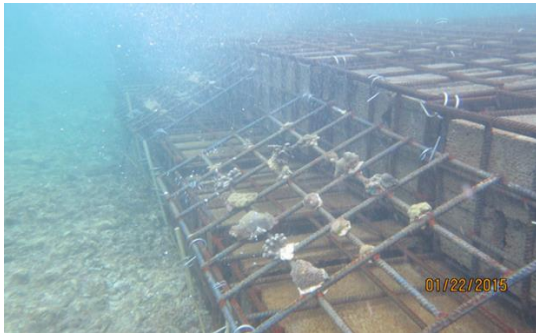
Installed Pilot Structure with Corals 2015

Environmental Benefits: The complete Reef Re-Engineered hybrid breakwater structures (Full Build-Out) will reduce 80-90% wave energy and alongshore currents, thus reducing erosion and run-up flooding at the beach. As the structures are seeded with corals and become reefs, they will grow and maintain their function, while increasing fish and other vital marine life in the bay.