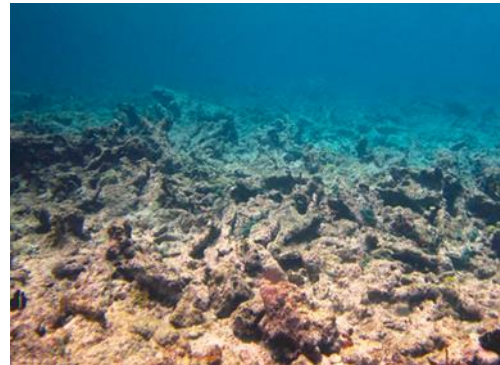
Northern Reef Grenville Bay

AWE Solutions: 1. Mangrove Restoration and Beach Revegetation, 2. Reef Re-Engineering.